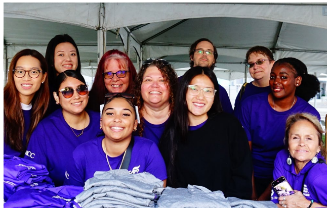
Your dedicated CCAPP team.

By registering with CCAPP, you join a network of professionals committed to ethical practice, cultural responsiveness, and continuous learning.